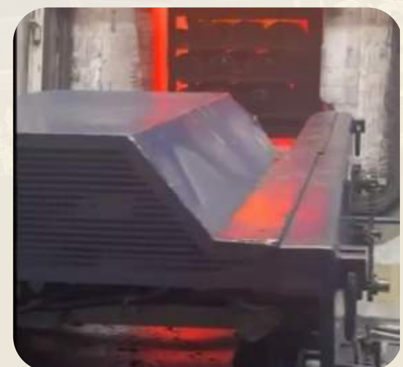
Sealed Quench Furnace