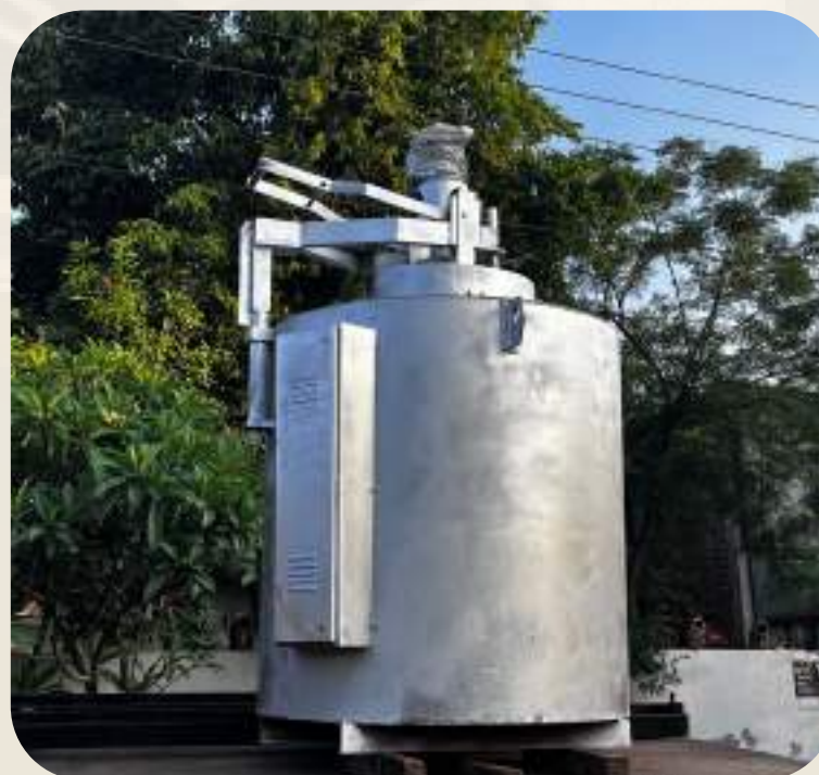
Pit Type Tempering Furnace