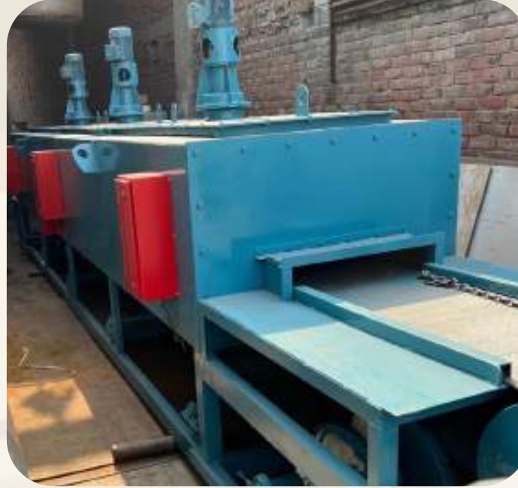
Continuous Tempering Furnace