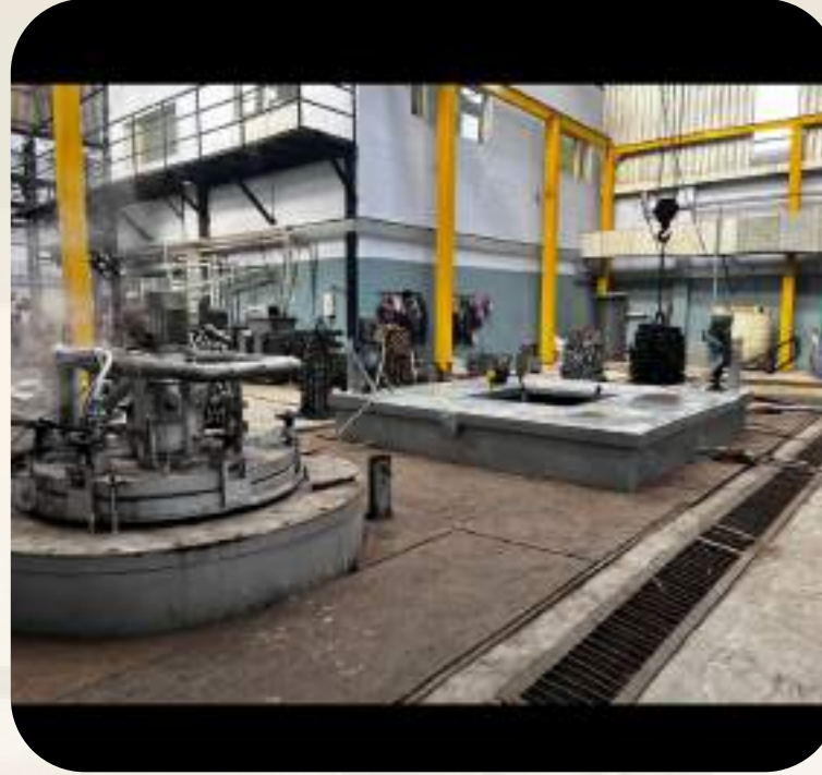
Gas Carburizing Furnace