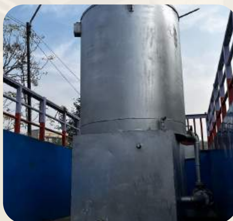
Industrial Washing Machine