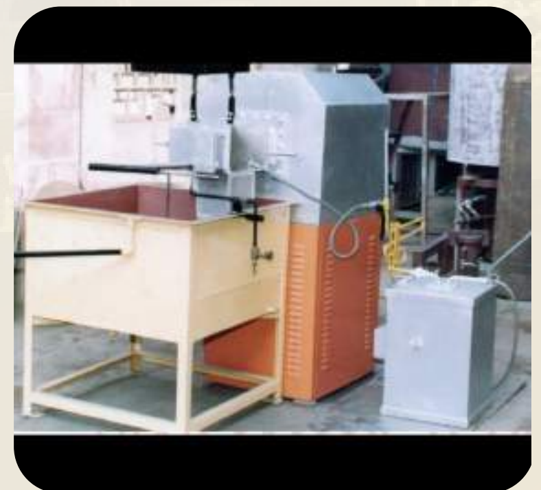
Bright Annealing Furnace