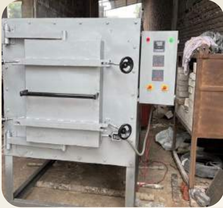
Chamber Type Furnace