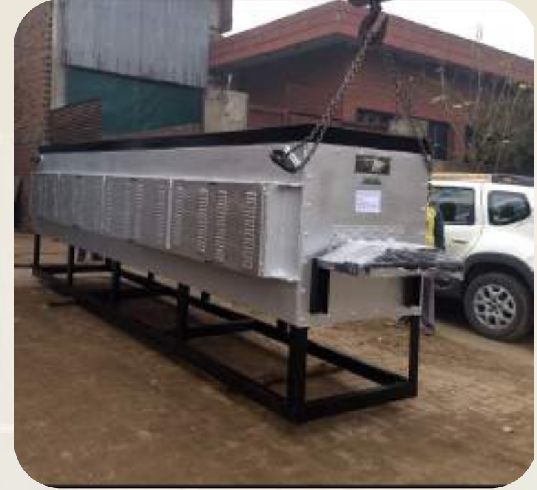
Blade Hardening Furnace