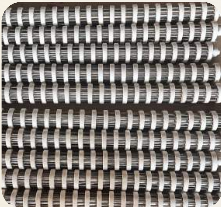
Radiant Tube Heaters