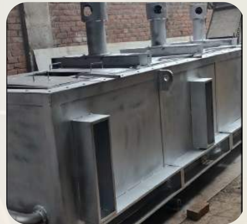
Salt Bath Furnace