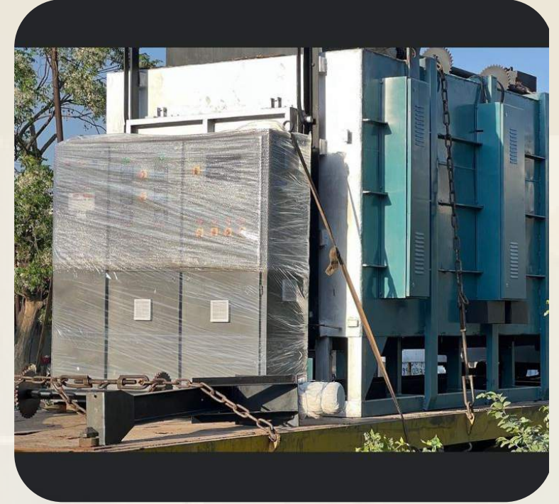
Bogie Hearth Furnace