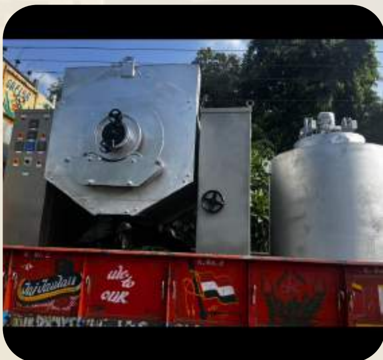
Rotary Retort Furnace