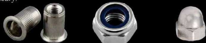
Rivet Insert Nut Nylock Nut Cap Nut