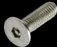
Pin Hex Security CSK Screw