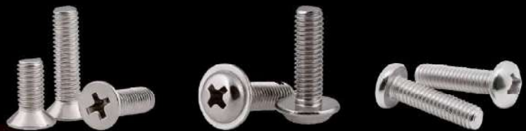
CSK Philips Screw Pan Philips Flange Head Screw Pan Philips Screw