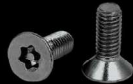
Pin Torx CSK Screw