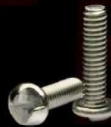
One Way Security Machine Screw