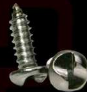
One Way Security Self Tapping Screw