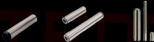
Solid Dowel Pin Internal Threaded Slotted Dowel Pin