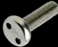
2H Pan Head Security Screw