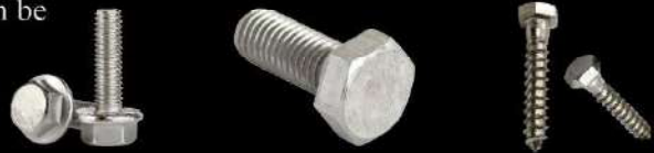
Hex Flange Bolt Hex Head Bolt Hex Wood Screw