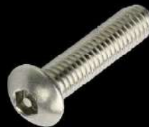
Pin Hex Security Button Screw