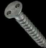
2H CSK Head Security Screw