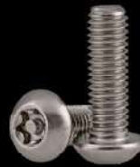
Pin Torx Button Head Screw