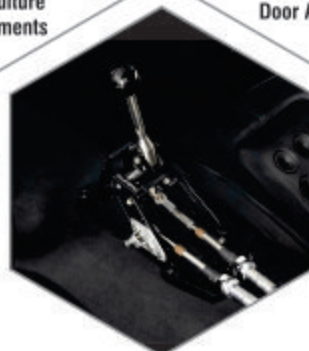
Cable Assembly Parts