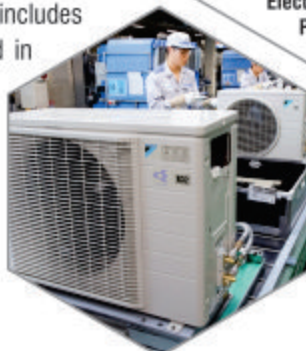
Air Conditioner Assembly