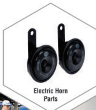
Electric Horn Parts

CSR offers its products and services for wide range of Fasteners, Cold forged and machined components (diameter ranging 3-16 mm) for Automotive as well as Non-automotive application. Along with the standard fasteners like Hex Head Bolts, Socket Head Bolts, Button Head Screws, Flange Bolts, Wheel Bolts, Hex Nuts, etc. its current product range includes customized components used in automotive cable assemblies, horns, brake assemblies, automotive door assemblies, clutch pedal assemblies, tractor seat assemblies, air conditioners, etc.