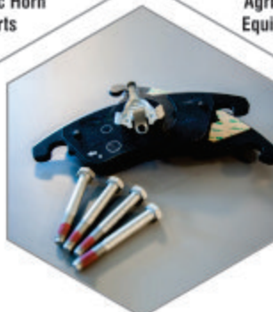
Brake Pad Assembly