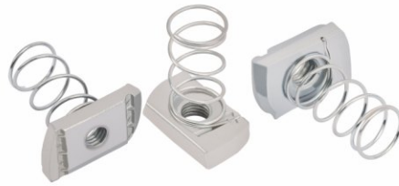
Spring Channel Nut