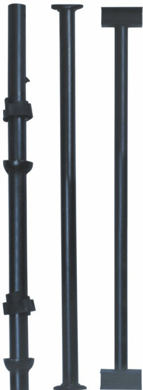
Cup Lock System