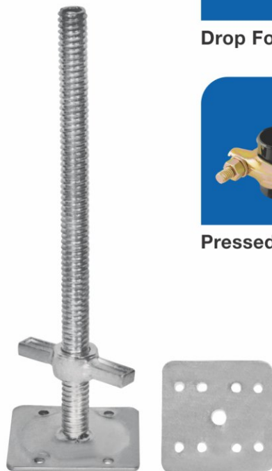
Jack & Base Plate