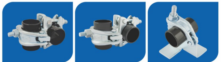
Drop Forged Coupler